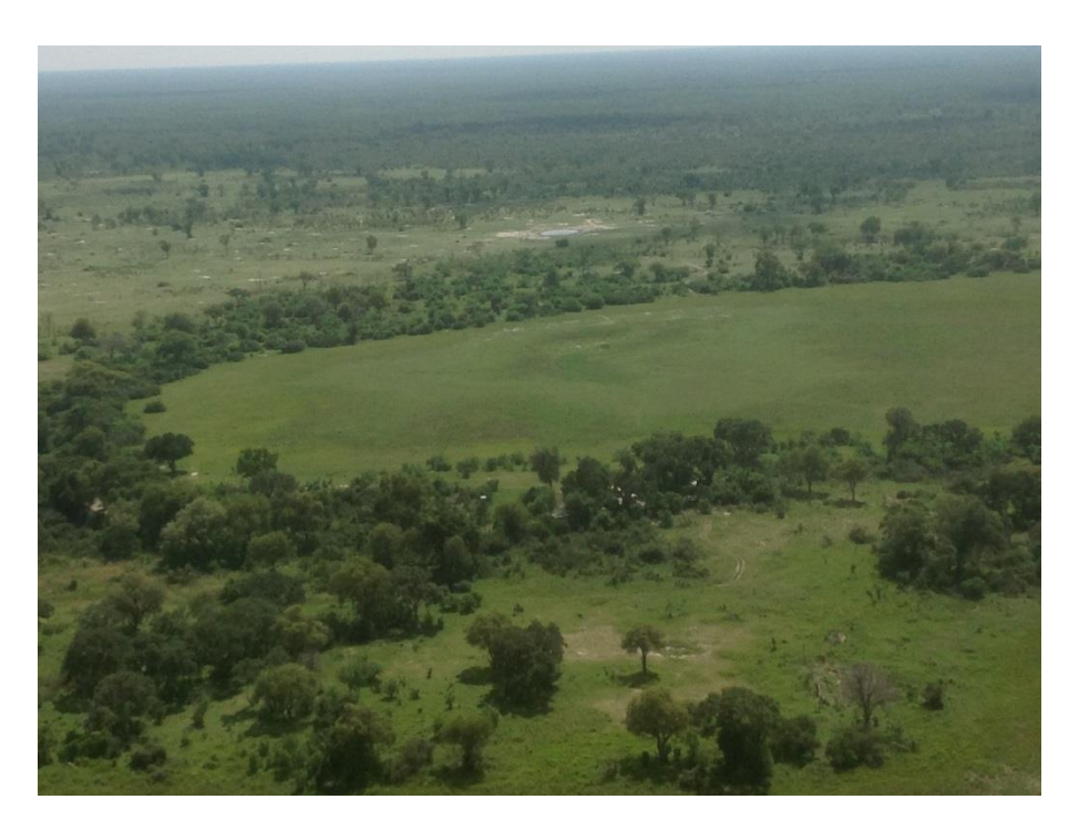
View of Splash camp from the air

Airstrip: Kwara (40 mins) Rates: All inclusive.