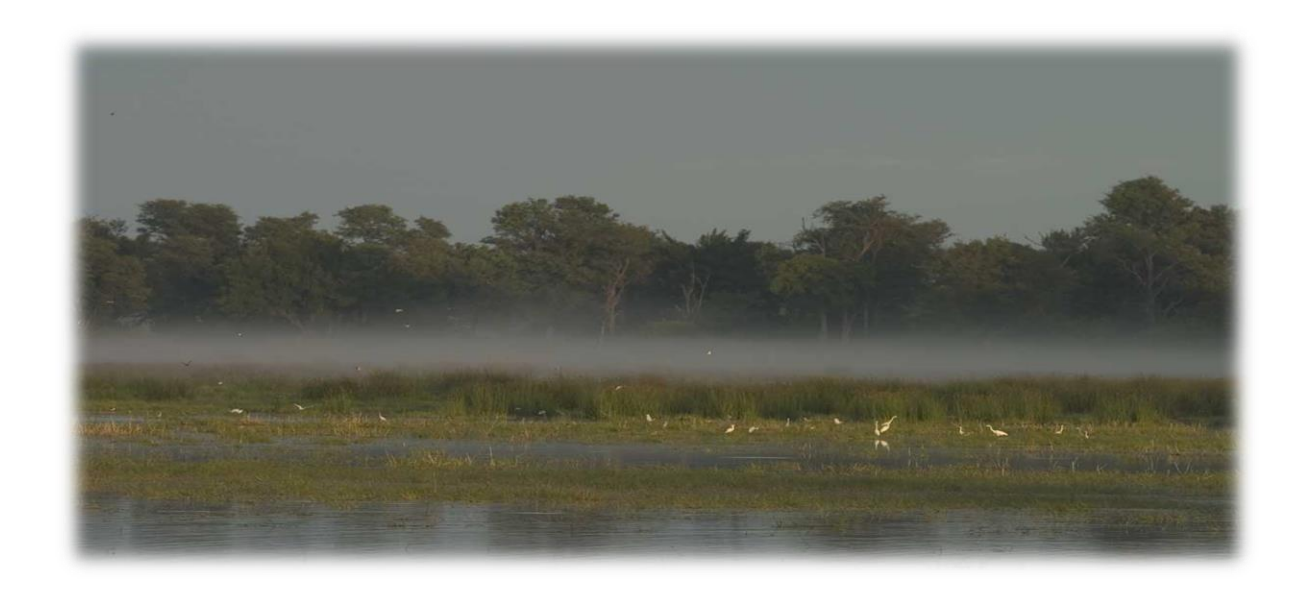
Vintage African Safaris – intimate camps with personalised service

The concession shares a 30km water boundary with the famous Moremi Game Reserve and it's unique location boasts both permanent water and seasonal flood plains as well as extensive dry bush wilderness. Favoured by labyrinths of permanent water channels and secret islands this area offers the perfect delta experience, and is considered to be amongst the best in Botswana for game viewing and activities.